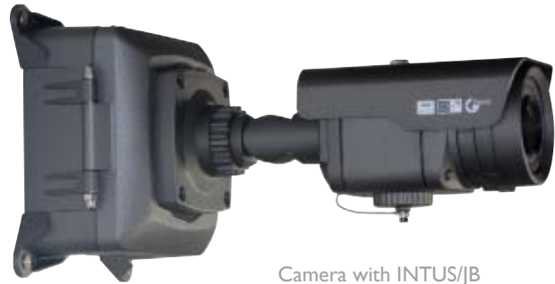
Camera with INTUS/JB