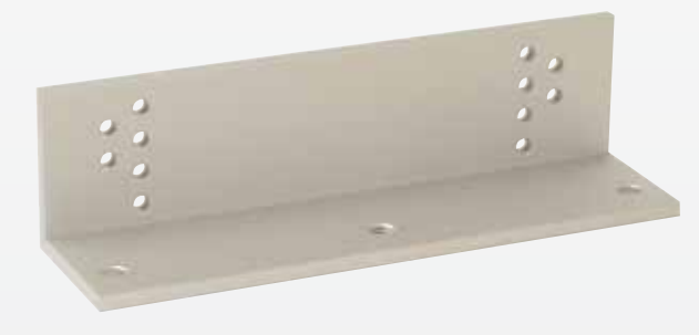
L & Z Bracket 30mm x 250mm x 48mm 50mm x 160mm x 50mm (adjustable plates)