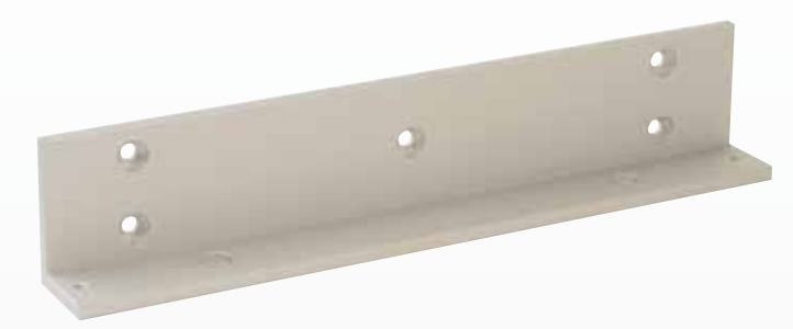
Adjustable L Bracket 30mm x 250mm x 48mm

Please note: To ensure immediate release, it is important that the release switch breaks the circuit between the power supply and the magnet