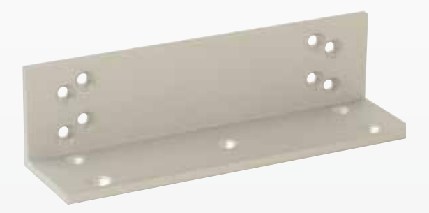
L & Z Bracket 30mm x 250mm x 48mm (adjustable and standard L brackets)