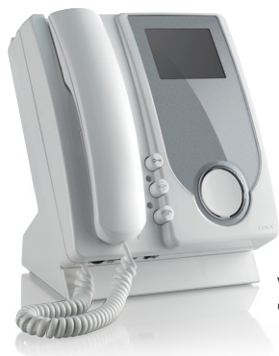
Version with desktop base