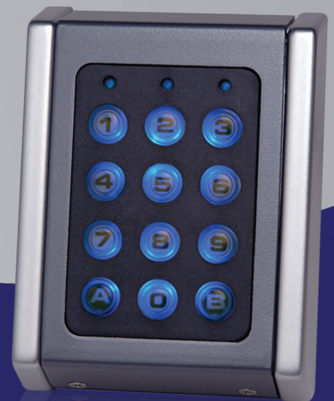
EX5P-73C PROX & CODE

These robust IP rated standalone keypads are designed to operate in both internal and external environments.