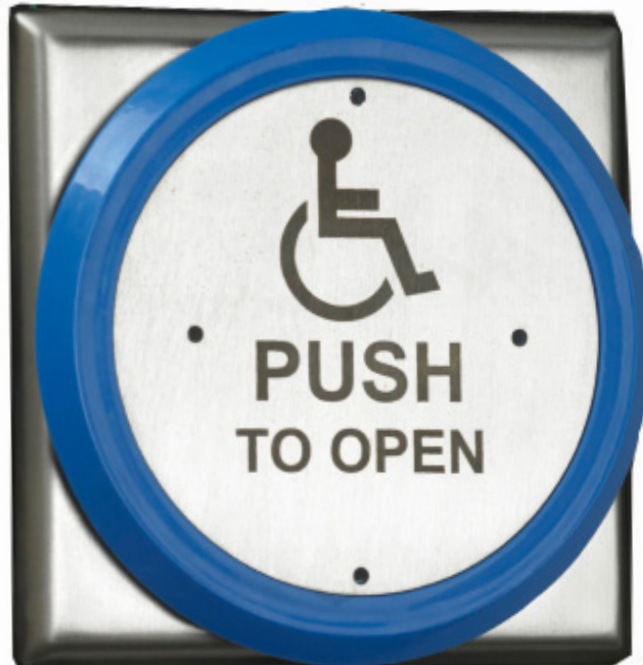
Push Plate DDA Button