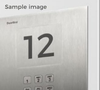
Sample image Engravable stainless steel panel included in delivery.