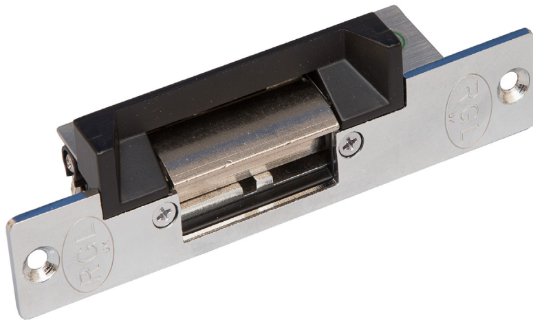
Ansi Electric Strike