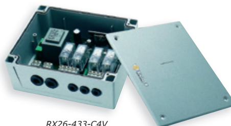
RX26-433-C4V (2 & 4 channel available) 140 x 115 x 53mm