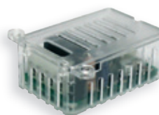
SEL2641R433NN (NANO) (1 channel) 50 x 32 x 20mm

For connection/compatibility of user identification to access control systems, we provide receivers which operate a Wiegand 26-bit technology.