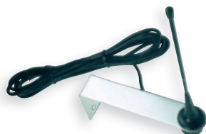
SEA433 Tuned aerial