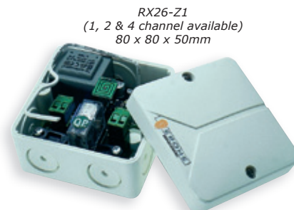
RX26-Z1 (1, 2 & 4 channel available) 80 x 80 x 50mm