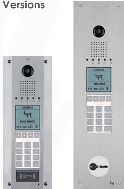
Standard Digitha Video entry panel