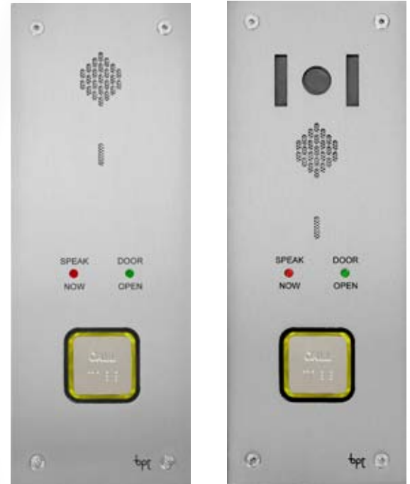
Audio entry panel