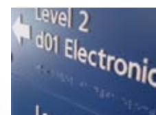
High contrast braille/tactile signage available

The HAV (monochrome) and HAVC (colour) camera units allow for an 11 degree adjustment angle on both vertical and horizontal planes. The standard viewing area is 530mm(v) x 710mm (h) providing an extensive viewing area for visitor recognition. For ease of installation, terminals to connect either traditional co-axial or twisted pair cable are provided to carry the video signal.