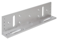
ZL Brackets for Standard Magnet (1200lb)