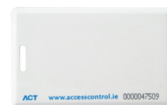
ACTProx HS Card