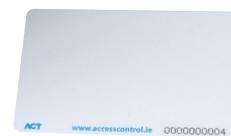
ACTProx ISO Card