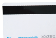
ACTProx DUO Card

Robust half shell card with max read range of 8cm