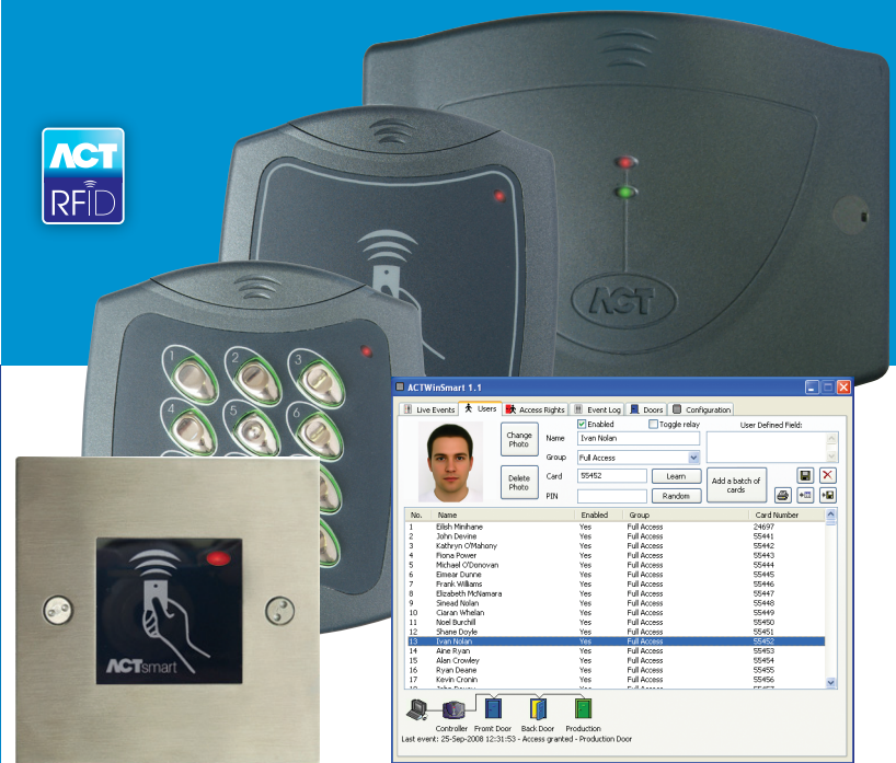
ACTsmart2 1070PM (with ACT PM Flush Plate - purchase separately)