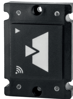
■ Panel mounted without cover