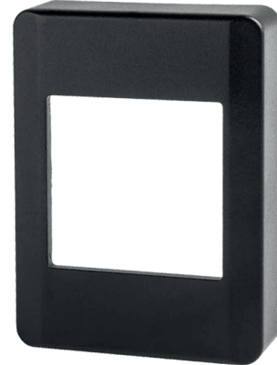
■ Cover panel (40 x 40mm cut out)