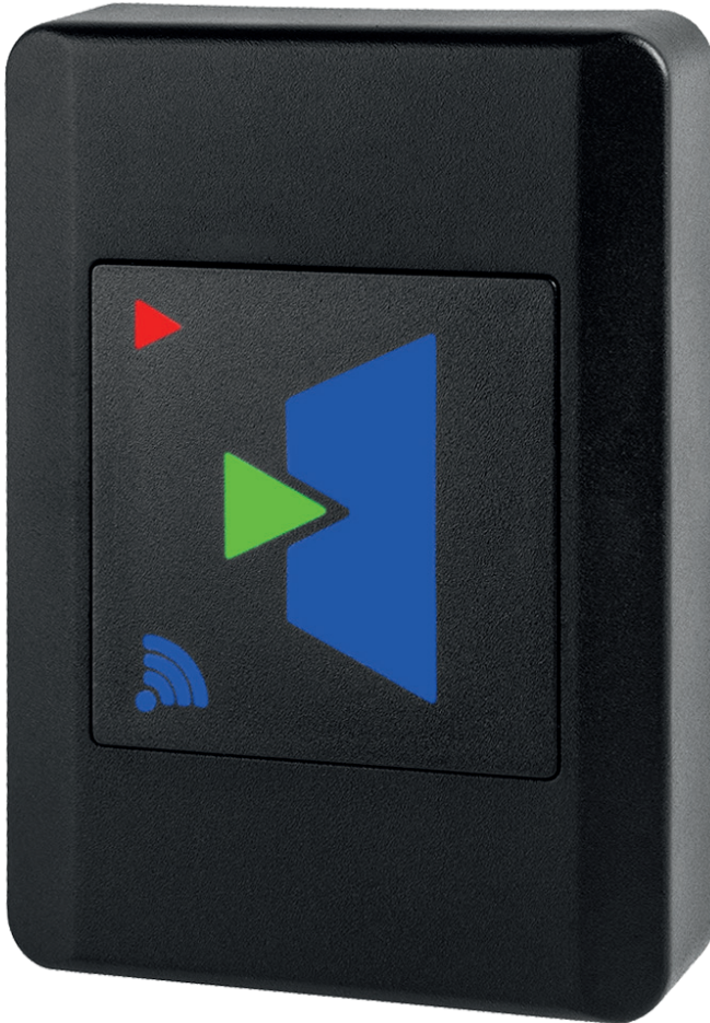
■ Wall mounted with cover