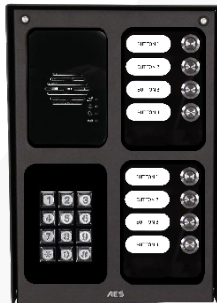
8 Button Assembled Unit