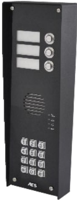
3 Button Assembled Unit