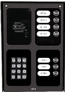
7 Button Assembled Unit