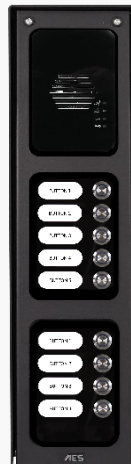
9 Button Assembled Unit