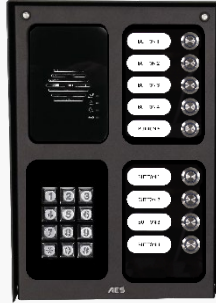
9 Button Assembled Unit