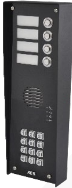
4 Button Assembled Unit