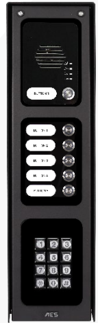
6 Button Assembled Unit