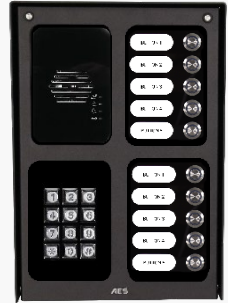
10 Button Assembled Unit