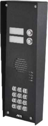
2 Button Assembled Unit