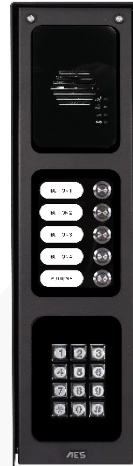
5 Button Assembled Unit