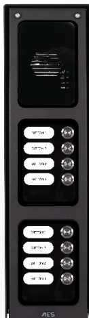
8 Button Assembled Unit