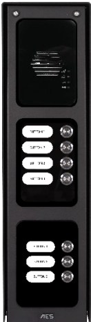
7 Button Assembled Unit