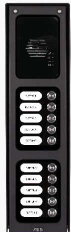
10 Button Assembled Unit