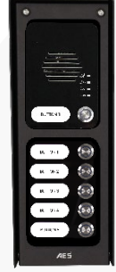
6 Button Assembled Unit