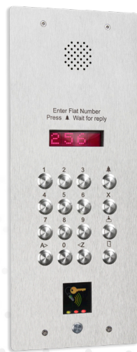
Model BFP-DIG/VR + PROXIMITY

Panels can include the option of a cut-out for a panel mount proximity reader (PROX-CO) and hi-visibility halo rings on the push-buttons for DDA compliance (HALO).