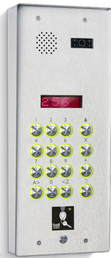
Model BFP-DIG/VRS + PROXIMITY