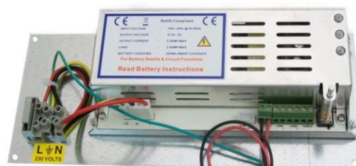
2402, 3, 5SM-CH